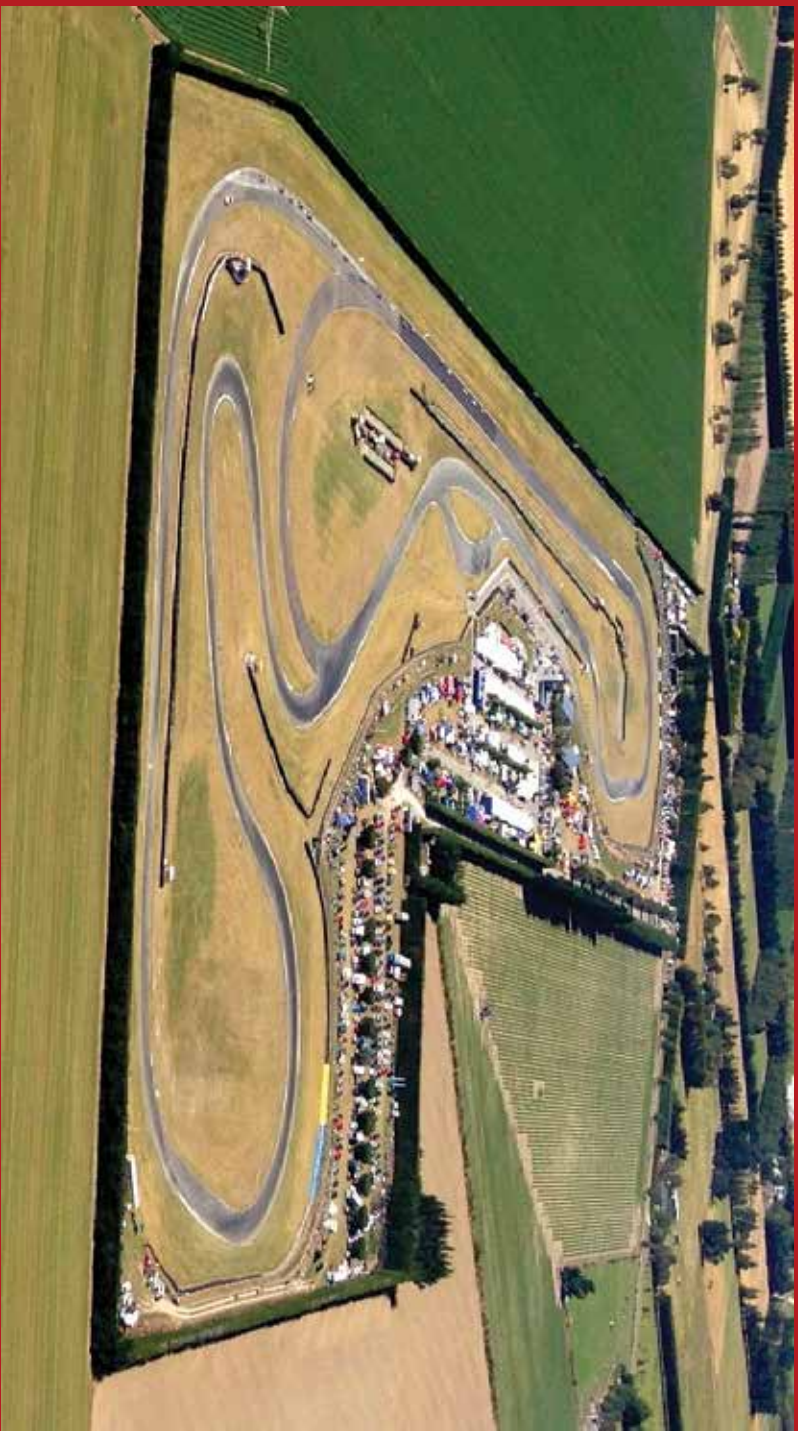
Timaru circuit from the air.