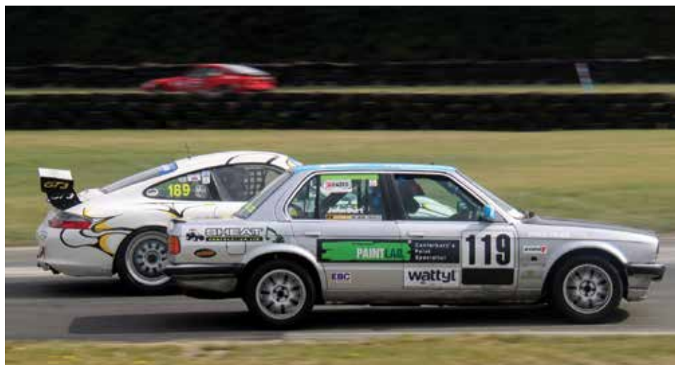
BMW neck and neck with Porsche